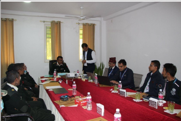
Photo Details: Orientation on HDPRP and Hub-satellite-PHEOC Network in Army Hospital, Pokhara.