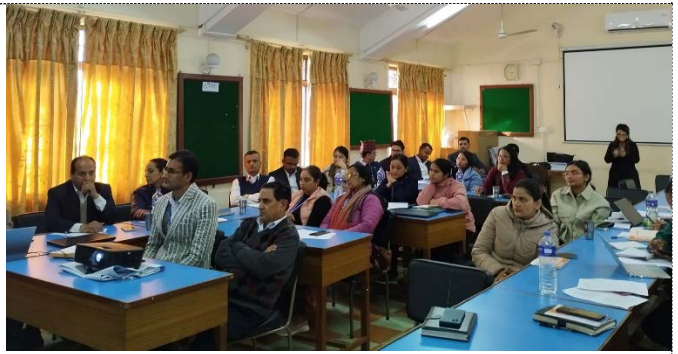
Photo Details: Interaction program on OCMC service effectiveness in Gandaki Province