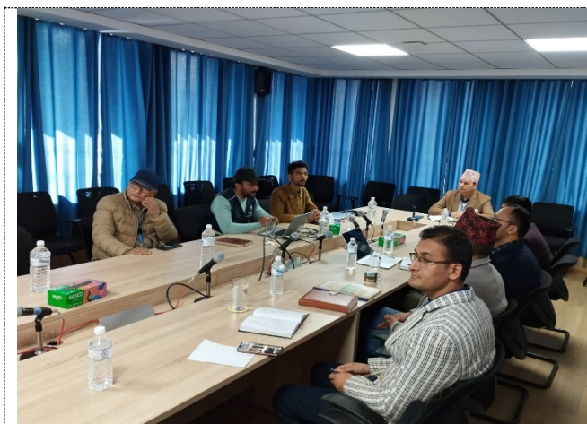
Photo Details: Meeting organized by MoSDH to share the Findings and Learnings from Food-Borne Disease Outbreak in Sundarbazar-8, Lumjung.