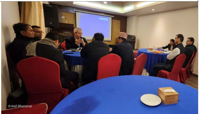
Photo Details: Provincial Supply Chain Management Working Committee meeting