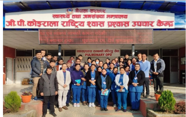
Photo Details: Orientation Program on Hospital Disaster Preparedness and Response Plan (HDPRP) and Hub-Satellite-PHEOC network" in GP Koirala National Center for Respiratory Disease in Tanahun