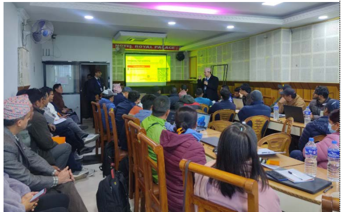
Photo Details: The MoSDH Health Secretary concluding the opening session of SORMAS users training program with his closing remarks.