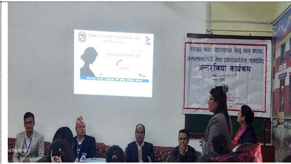
Photo Details: Interaction program on OCMC service effectiveness in Gandaki Province