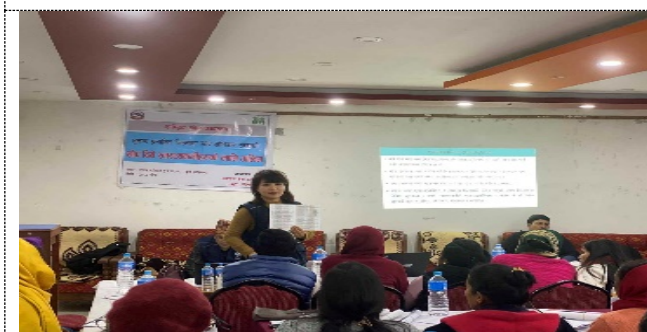
Photo Details: Technical assistance in district microplanning workshop and 4 batches of vaccinators training on MR and TCV SIA