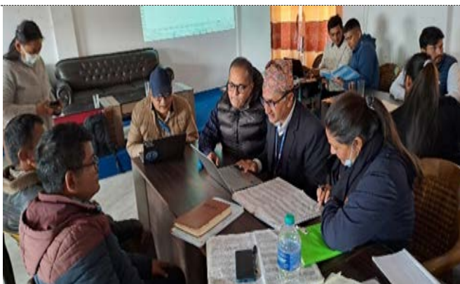
Photo Details: Joint visit in Palika level EPI quarterly review meeting organized by Madi Rural Municipality of Kaski