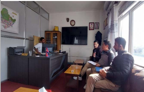
Photo Details: Meeting between WHO team and PPHL Director to plan the conduction of a program with private laboratories of the province.