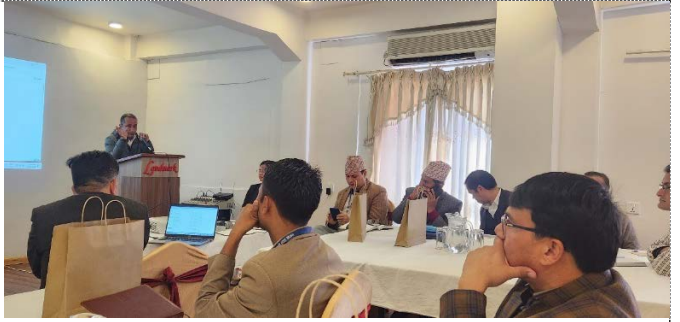
Photo Details: Sharing workshop of Diagnostic assessment of HCWM and WASH in HCFs of Gandaki Province