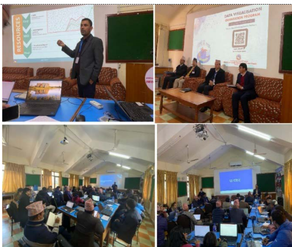
Photo Details: WHO IMA, NPO (IHR), NPO (HIMA) presenting on individual agendas of "Data Visualization Orientation" organized by MoSDH