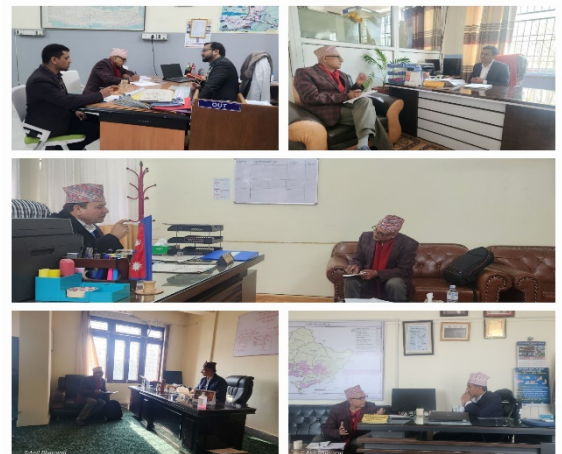
Photo Details: KIIs for scoping on national referral guideline development