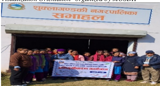
Photo details: Vaccine management training at Shukla Gandaki Municipality of Tanahun