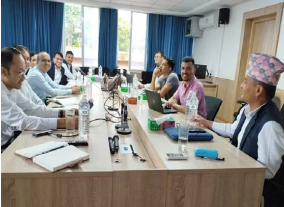
Photo Details: Meeting to draft second five-year plan of Gandaki province