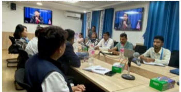
Photo Details: Glimpse of Hybrid Orientation Program on Dengue and Seasonal Hyper-Acute Pan Uveitis (SHAPU) organized by the Ministry of Social Development and Health, Gandaki Province.