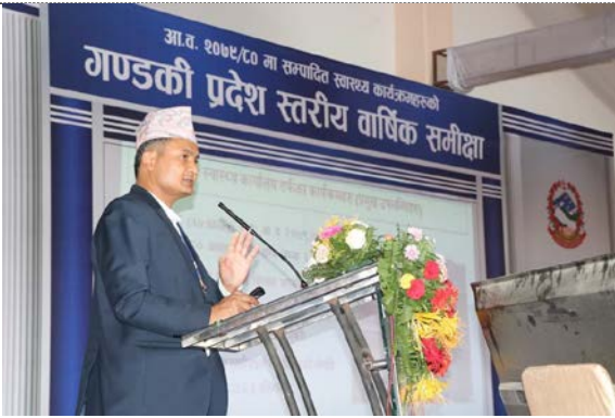
Photo Details: DG, Health directorate presenting in the Annual Health review meeting