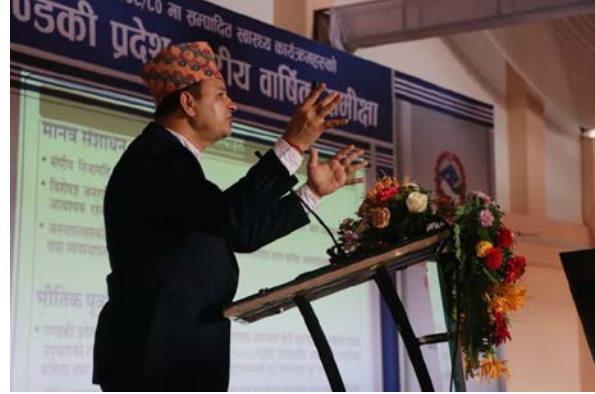
Photo Details: Secretary MoSDH, delivering his remarks in Annual Health review meeting