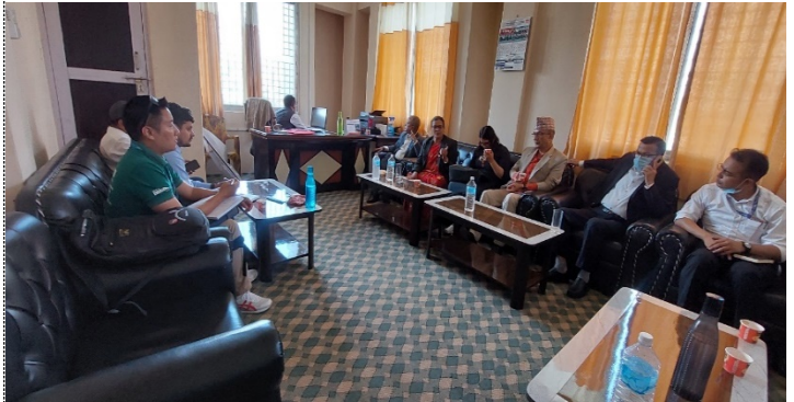
Photo Details: Briefing Hon. Minister of Social Development and Health during a meeting in Tanahun Health Office regarding the activities planned and way forward for dengue response.