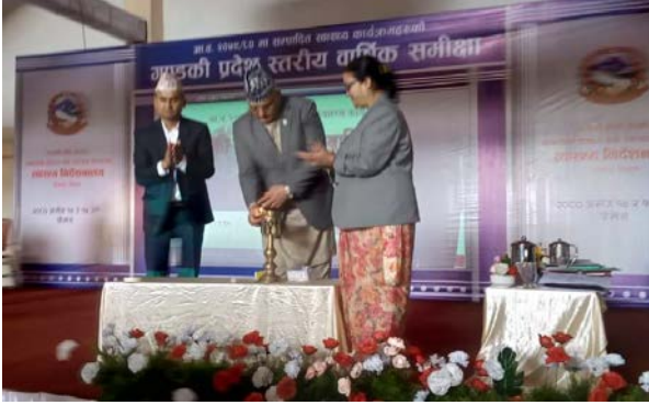
Photo Details: Hon. Chief Minister inaugurating Provincial annual health review meeting