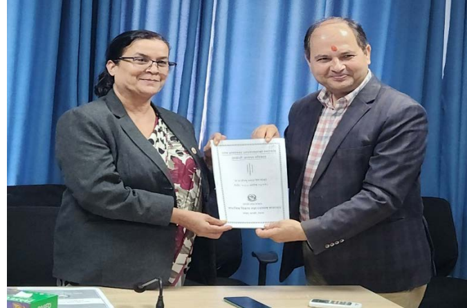
Photo Details: MoSDH secretary handing over Hospital Upgradation report to Hon. Minister