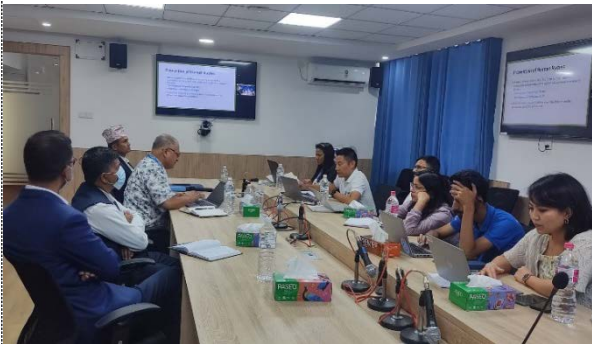
Photo Details: Presentation on rabies management guideline conducted by FMO